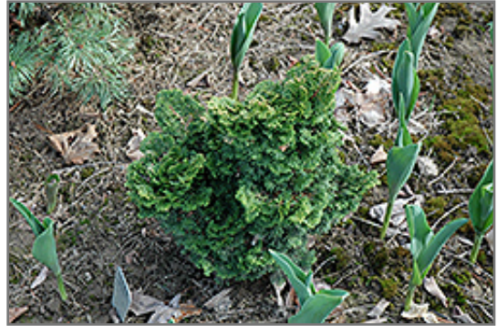
Leprechaun Dwarf Hinoki Falsecypress

A tremendous, very compact globe shaped plant that will become more pyramidal with age; nice bright green color; excellent as a small accent or in containers