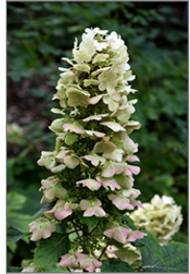
Munchkin Hydrangea flowers

This shrub performs well in both full sun and full shade. It prefers to grow in average to moist conditions, and shouldn't be allowed to dry out. It is not particular as to soil type or pH. It is somewhat tolerant of urban pollution, and will benefit from being planted in a relatively sheltered location. Consider applying a thick mulch around the root zone in winter to protect it in exposed locations or colder microclimates. This is a selection of a native North American species.