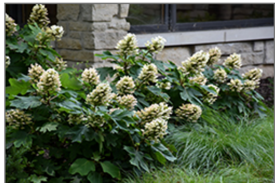
Munchkin Hydrangea flowers