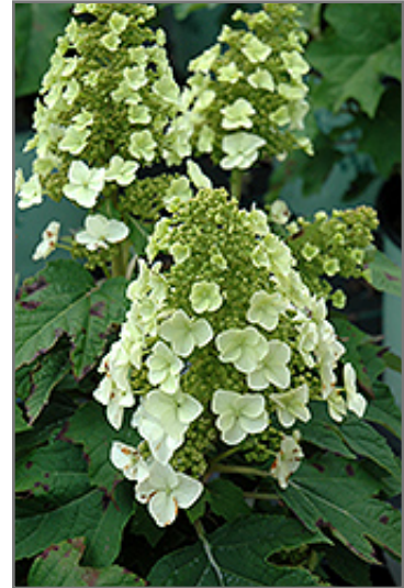
Munchkin Hydrangea flowers

Munchkin Hydrangea is recommended for the following landscape applications;