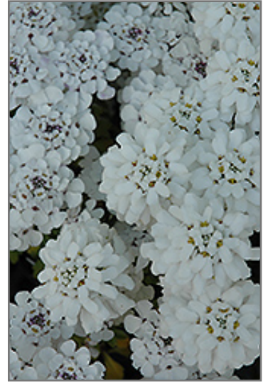
Masterpiece Candytuft flowers