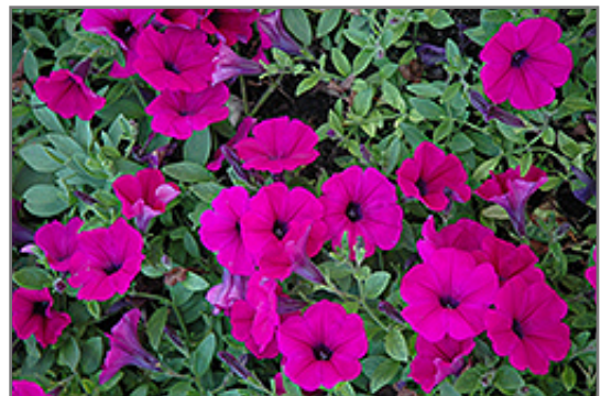
Wave Purple Classic Petunia flowers