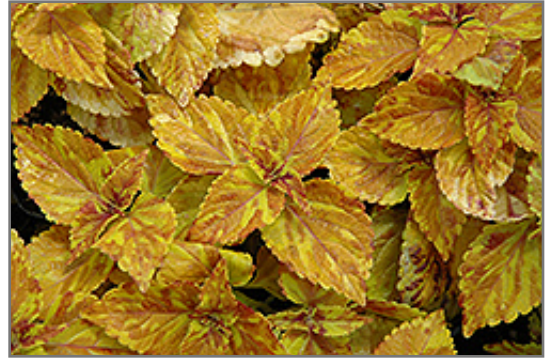
Freckles Coleus foliage

Freckles Coleus will grow to be about 24 inches tall at maturity, with a spread of 24 inches. When grown in masses or used as a bedding plant, individual plants should be spaced approximately 18 inches apart. It grows at a fast rate, and under ideal conditions can be expected to live for approximately 5 years. As an evergreen perennial, this plant will typically keep its form and foliage year-round.