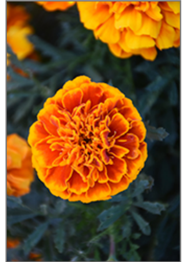
Bonanza Flame Marigold flowers