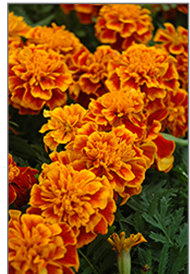
Bonanza Flame Marigold flowers