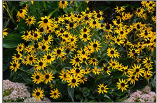
Little Goldstar Coneflower in bloom

This is a relatively low maintenance plant, and should be cut back in late fall in preparation for winter. It is a good choice for attracting butterflies to your yard, but is not particularly attractive to deer who tend to leave it alone in favor of tastier treats. It has no significant negative characteristics.