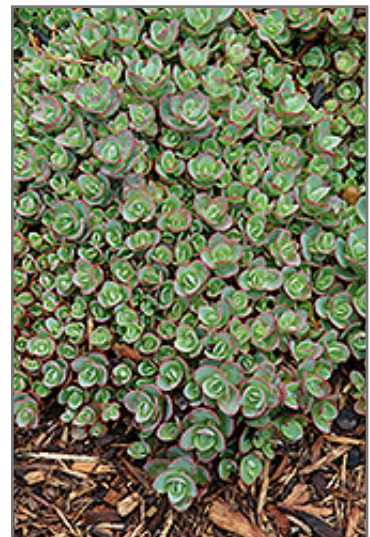
Lime Zinger Stonecrop