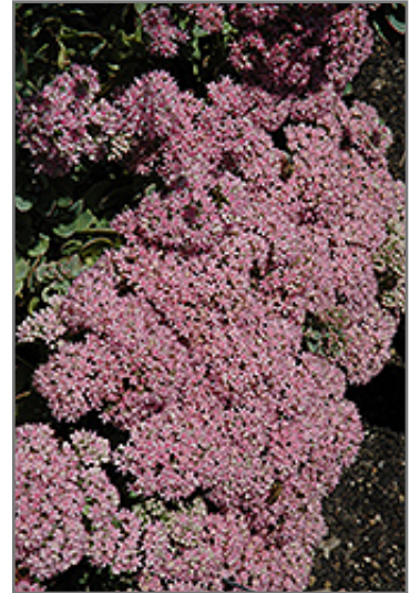
Lime Zinger Stonecrop flowers

This is a relatively low maintenance plant, and is best cleaned up in early spring before it resumes active growth for the season. It is a good choice for attracting bees and butterflies to your yard, but is not particularly attractive to deer who tend to leave it alone in favor of tastier treats. It has no significant negative characteristics.