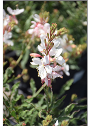
Belleza White Gaura flowers

Belleza White Gaura is recommended for the following landscape applications;