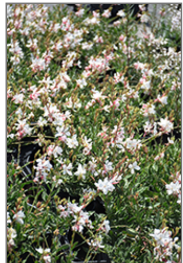
Belleza White Gaura in bloom