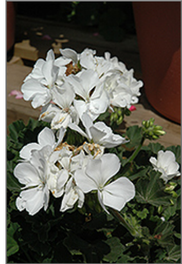
Presto White Geranium flowers

Presto White Geranium features bold balls of lightly-scented white flowers at the ends of the stems from late spring to early fall. The flowers are excellent for cutting. Its tomentose round palmate leaves remain green in color with prominent brown stripes throughout the year.