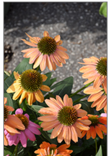
Cheyenne Spirit Coneflower flowers