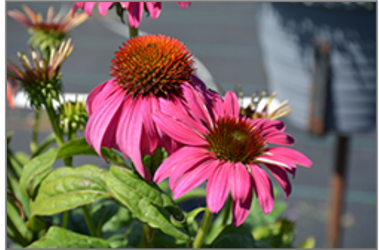
Cheyenne Spirit Coneflower flowers

Cheyenne Spirit Coneflower will grow to be about 16 inches tall at maturity extending to 24 inches tall with the flowers, with a spread of 18 inches. Its foliage tends to remain dense right to the ground, not requiring facer plants in front. It grows at a medium rate, and under ideal conditions can be expected to live for approximately 10 years. As an herbaceous perennial, this plant will usually die back to the crown each winter, and will regrow from the base each spring. Be careful not to disturb the crown in late winter when it may not be readily seen!