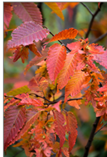
Firespire American Hornbeam in fall