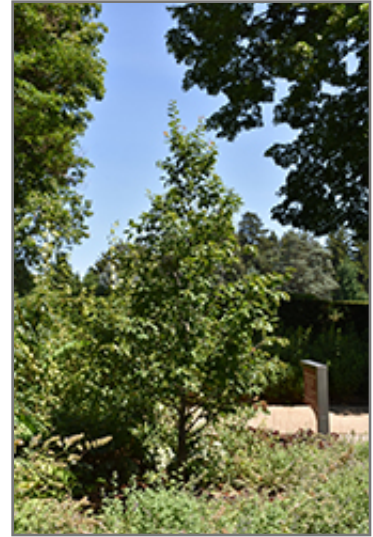
Firespire American Hornbeam

This tree performs well in both full sun and full shade. It is an amazingly adaptable plant, tolerating both dry conditions and even some standing water. It is not particular as to soil type or pH. It is somewhat tolerant of urban pollution. This is a selection of a native North American species.