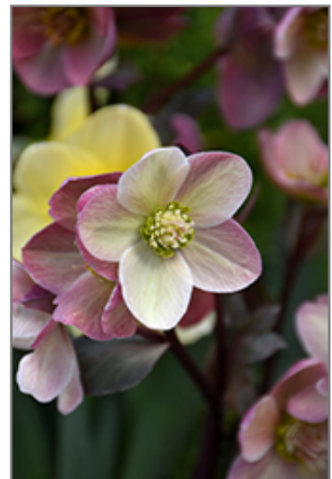
Pink Frost Hellebore flowers