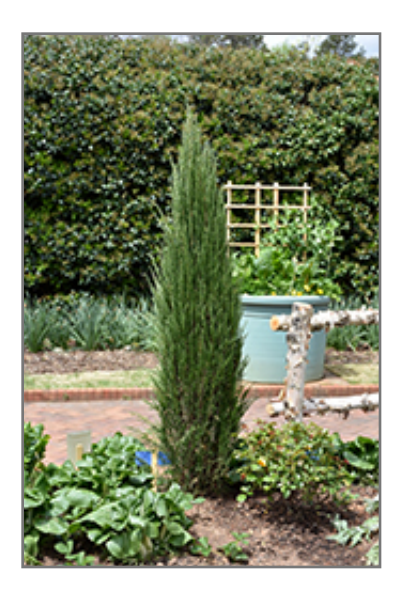
Blue Arrow Juniper