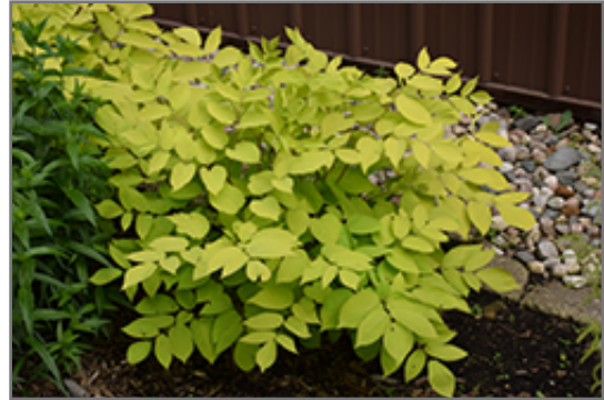
Sun King Japanese Spikenard