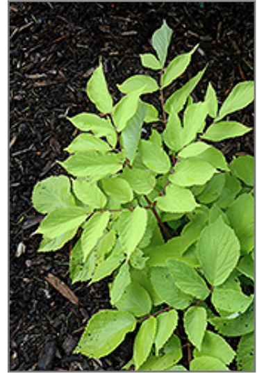
Sun King Japanese Spikenard foliage

This plant performs well in both full sun and full shade. It prefers to grow in average to moist conditions, and shouldn't be allowed to dry out. It is not particular as to soil type or pH. It is highly tolerant of urban pollution and will even thrive in inner city environments. This is a selected variety of a species not originally from North America.