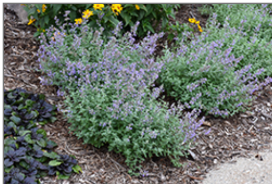
Purrsian Blue Catmint in bloom