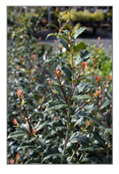
San Jose Sweet Olive foliage

1020 S 42nd St Springfield, OR 97478 (541) 744-0372 littleredfarmnursery.com