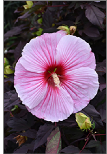
Starry Starry Night Hibiscus flowers

This plant will require occasional maintenance and upkeep, and should be cut back in late fall in preparation for winter. It is a good choice for attracting butterflies and hummingbirds to your yard, but is not particularly attractive to deer who tend to leave it alone in favor of tastier treats. Gardeners should be aware of the following characteristic(s) that may warrant special consideration;