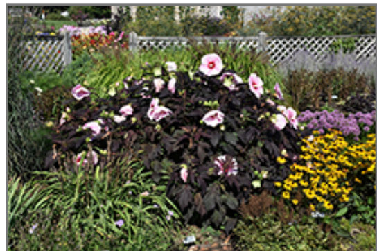
Starry Starry Night Hibiscus in bloom