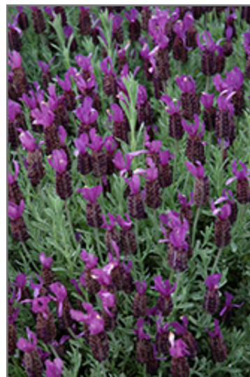
Anouk Supreme Spanish Lavender flowers

Anouk Supreme Spanish Lavender is recommended for the following landscape applications;