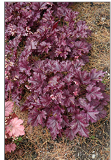
Forever Purple Coral Bells