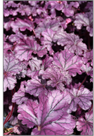
Forever Purple Coral Bells foliage

Forever Purple Coral Bells is recommended for the following landscape applications;