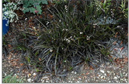
Black Mondo Grass in bloom

Other Names: syn. Ophiopogon nigrescens , Black Dragon