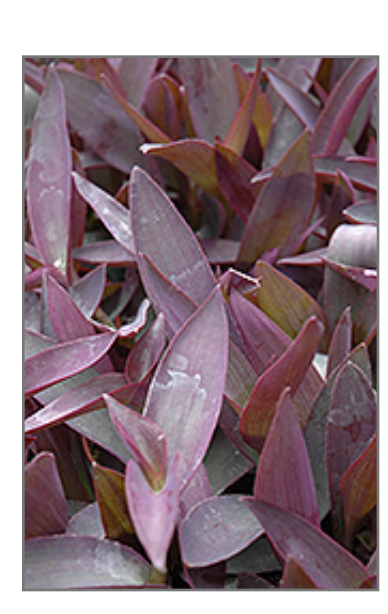
Purple Heart foliage

relatively fine texture sets it apart from other indoor plants with less refined foliage. This plant may benefit from an occasional pruning to look its best.