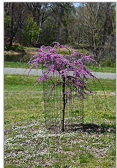
Pink Heartbreaker Redbud in bloom