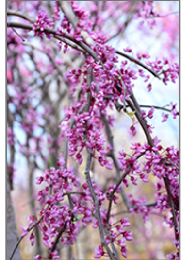
Pink Heartbreaker Redbud flowers

Pink Heartbreaker Redbud is recommended for the following landscape applications;