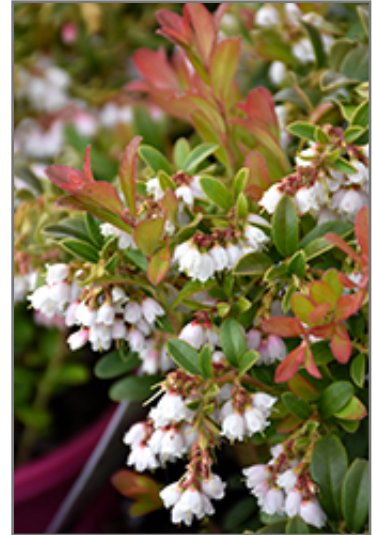
Koralle Lingonberry flowers

Koralle Lingonberry features dainty clusters of white bell-shaped flowers with shell pink overtones hanging below the branches in mid spring. It has dark green foliage with pointy light green spines. The small glossy oval leaves turn an outstanding burgundy in the fall, which persists throughout the winter. It features an abundance of magnificent cherry red berries in mid summer.