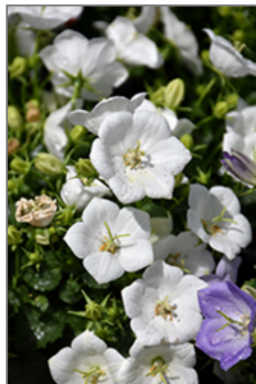
Rapido White Bellflower flowers