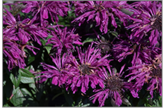
Rockin' Raspberry Beebalm flowers