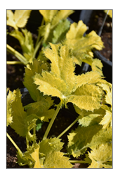
Neptune's Gold Sea Holly foliage