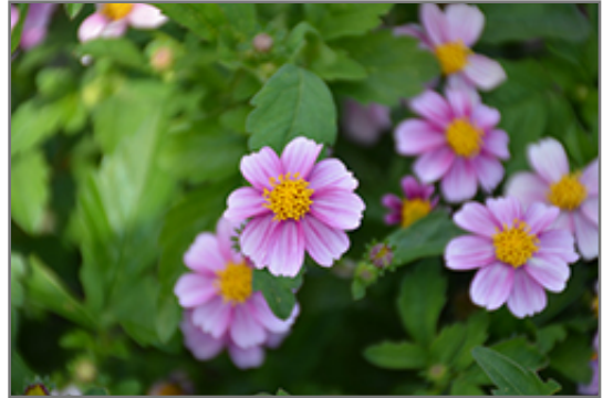
Pretty in Pink Bidens flowers

Pretty in Pink Bidens is recommended for the following landscape applications;