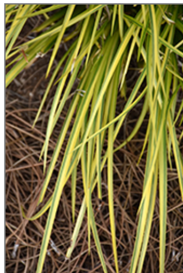
EverColor Everoro Japanese Sedge foliage

EverColor Everoro Japanese Sedge is recommended for the following landscape applications;