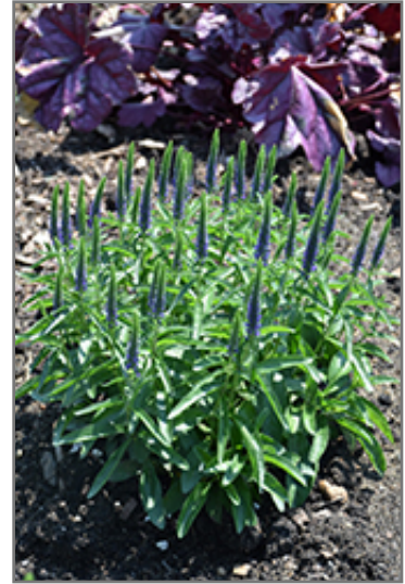
Magic Show Wizard of Ahhs Speedwell in bloom

Magic Show Wizard of Ahhs Speedwell is a fine choice for the garden, but it is also a good selection for planting in outdoor pots and containers. It is often used as a 'filler' in the 'spiller-thriller-filler' container combination, providing a mass of flowers against which the larger thriller plants stand out. Note that when growing plants in outdoor containers and baskets, they may require more frequent waterings than they would in the yard or garden.