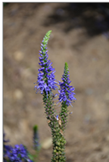
Magic Show Wizard of Ahhs Speedwell flowers