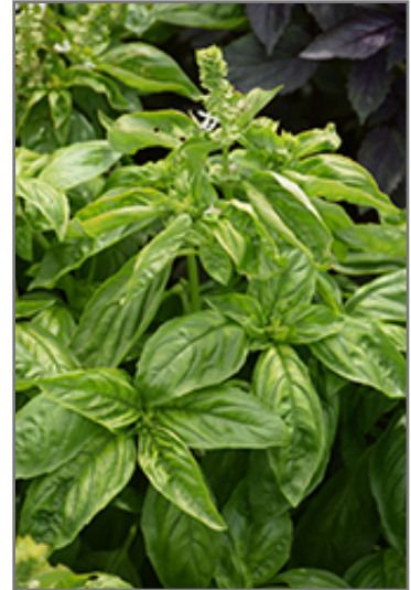
Genovese Basil foliage

Genovese Basil will grow to be about 20 inches tall at maturity, with a spread of 14 inches. When grown in masses or used as a bedding plant, individual plants should be spaced approximately 12 inches apart. This fast-growing annual will normally live for one full growing season, needing replacement the following year.