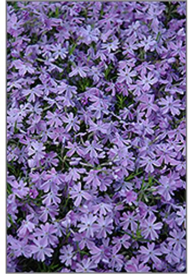
Emerald Blue Moss Phlox flowers