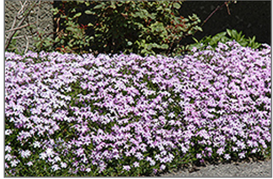
Emerald Blue Moss Phlox in bloom

This plant does best in full sun to partial shade. It prefers dry to average moisture levels with very well-drained soil, and will often die in standing water. It is considered to be drought-tolerant, and thus makes an ideal choice for a low-water garden or xeriscape application. It is not particular as to soil type, but has a definite preference for alkaline soils. It is highly tolerant of urban pollution and will even thrive in inner city environments. Consider covering it with a thick layer of mulch in winter to protect it in exposed locations or colder microclimates. This is a selection of a native North American species. It can be propagated by division; however, as a cultivated variety, be aware that it may be subject to certain restrictions or prohibitions on propagation.