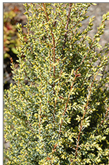
Gold Cone Juniper foliage