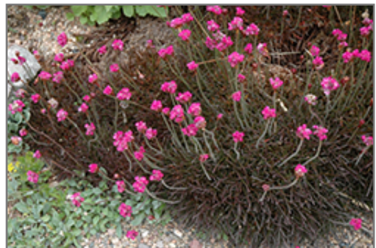
Red-leaved Sea Thrift in bloom