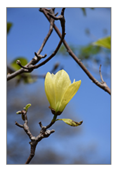
Butterflies Magnolia flowers