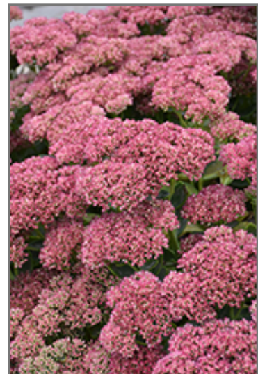
Autumn Fire Stonecrop flowers