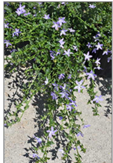
Blue Waterfall Serbian Bellflower in bloom