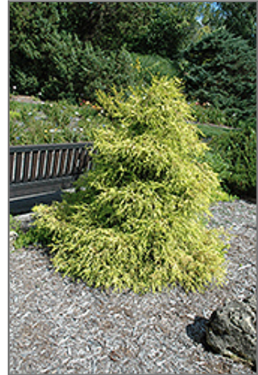
Lemon Thread Falsecypress

Lemon Thread Falsecypress is recommended for the following landscape applications;