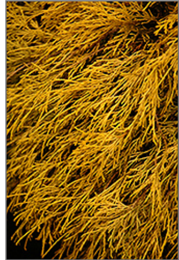
Lemon Thread Falsecypress foliage

Lemon Thread Falsecypress makes a fine choice for the outdoor landscape, but it is also well-suited for use in outdoor pots and containers. Because of its height, it is often used as a 'thriller' in the 'spiller-thriller-filler' container combination; plant it near the center of the pot, surrounded by smaller plants and those that spill over the edges. It is even sizeable enough that it can be grown alone in a suitable container. Note that when grown in a container, it may not perform exactly as indicated on the tag - this is to be expected. Also note that when growing plants in outdoor containers and baskets, they may require more frequent waterings than they would in the yard or garden.