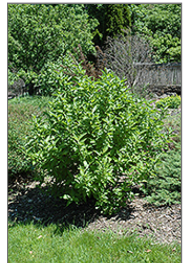
Arctic Fire Red Twig Dogwood