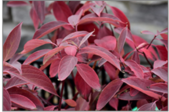
Arctic Fire Red Twig Dogwood in fall

This shrub does best in full sun to partial shade. It is an amazingly adaptable plant, tolerating both dry conditions and even some standing water. It is not particular as to soil type or pH. It is highly tolerant of urban pollution and will even thrive in inner city environments. This is a selection of a native North American species.