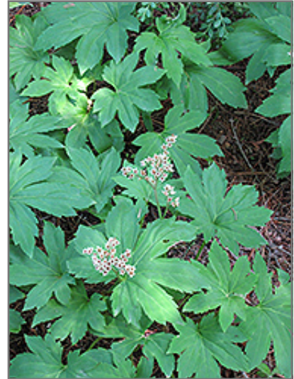
Crimson Fans Mukdenia flowers

Crimson Fans Mukdenia will grow to be about 12 inches tall at maturity extending to 18 inches tall with the flowers, with a spread of 24 inches. When grown in masses or used as a bedding plant, individual plants should be spaced approximately 20 inches apart. Its foliage tends to remain dense right to the ground, not requiring facer plants in front. It grows at a medium rate, and under ideal conditions can be expected to live for approximately 10 years. As an herbaceous perennial, this plant will usually die back to the crown each winter, and will regrow from the base each spring. Be careful not to disturb the crown in late winter when it may not be readily seen!