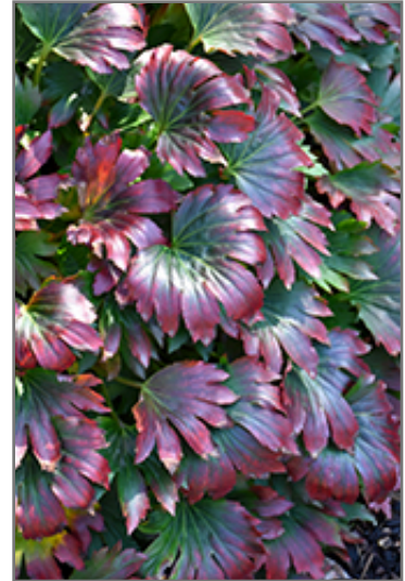
Crimson Fans Mukdenia foliage

This is a relatively low maintenance plant, and is best cleaned up in early spring before it resumes active growth for the season. It has no significant negative characteristics.