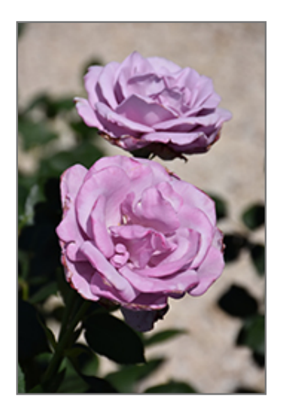
Blue Girl Rose flowers