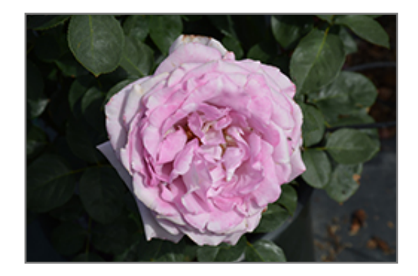
Blue Girl Rose flowers