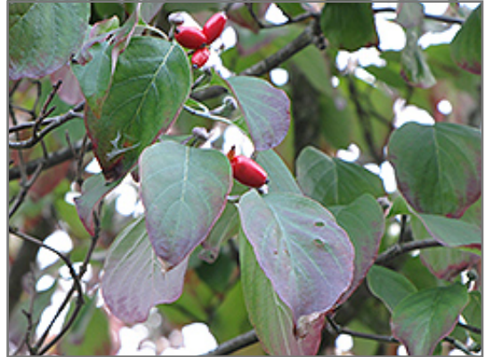
Cherokee Chief Flowering Dogwood fruit

This tree does best in full sun to partial shade. You may want to keep it away from hot, dry locations that receive direct afternoon sun or which get reflected sunlight, such as against the south side of a white wall. It requires an evenly moist well-drained soil for optimal growth, but will die in standing water. It is very fussy about its soil conditions and must have rich, acidic soils to ensure success, and is subject to chlorosis (yellowing) of the foliage in alkaline soils. It is quite intolerant of urban pollution, therefore inner city or urban streetside plantings are best avoided, and will benefit from being planted in a relatively sheltered location. Consider applying a thick mulch around the root zone in winter to protect it in exposed locations or colder microclimates. This is a selection of a native North American species.