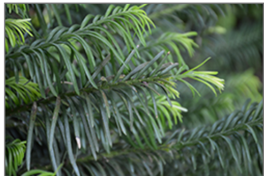
Duke Gardens Plum Yew foliage