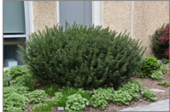
Duke Gardens Plum Yew

Duke Gardens Plum Yew is recommended for the following landscape applications;