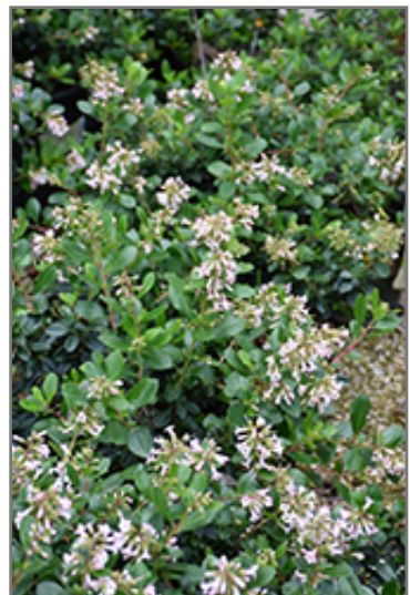
Pink Princess Escallonia in bloom