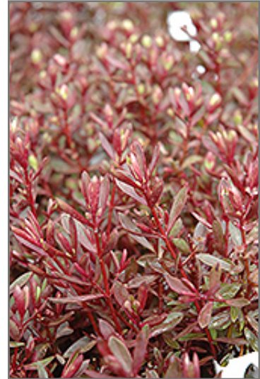
Caledonia Hebe foliage