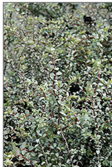
Quicksilver Hebe foliage

An evergreen shrub with an open arching habit; the light gray-green leaves greatly contrast the thin black stems; fine violet flowers appear in early summer; adds interest to a shrub border or container