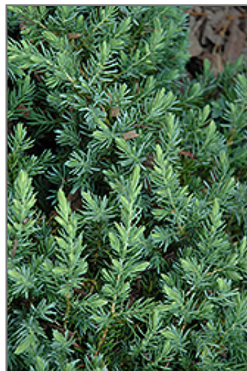
Blue Pacific Shore Juniper foliage