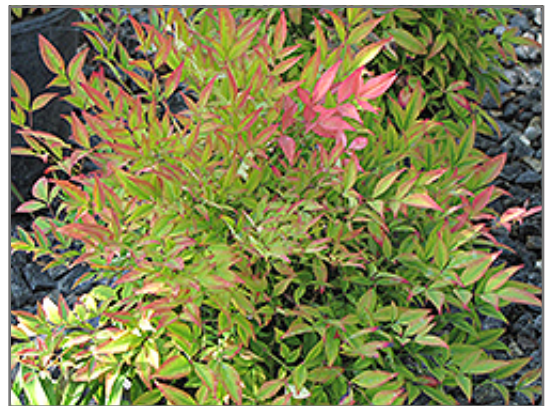
Moon Bay Dwarf Nandina