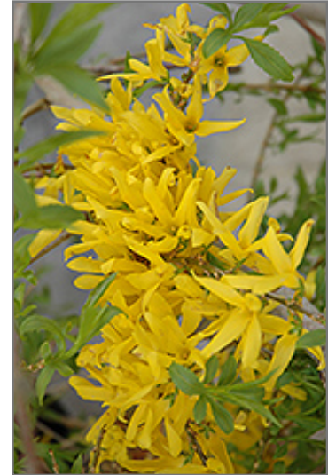
Gold Tide Forsythia flowers

Gold Tide Forsythia is recommended for the following landscape applications;