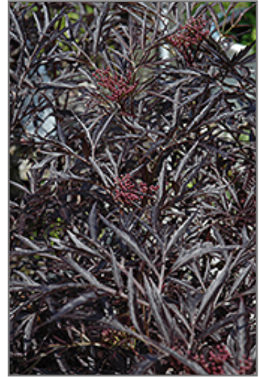
Black Lace Elder flowers

This shrub does best in full sun to partial shade. It is quite adaptable, preferring to grow in average to wet conditions, and will even tolerate some standing water. It is not particular as to soil type or pH. It is highly tolerant of urban pollution and will even thrive in inner city environments. This is a selected variety of a species not originally from North America.