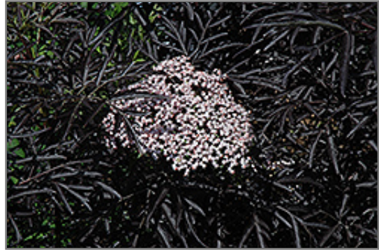
Black Lace Elder flowers

This is a high maintenance shrub that will require regular care and upkeep, and is best pruned in late winter once the threat of extreme cold has passed. It is a good choice for attracting birds to your yard. Gardeners should be aware of the following characteristic(s) that may warrant special consideration;