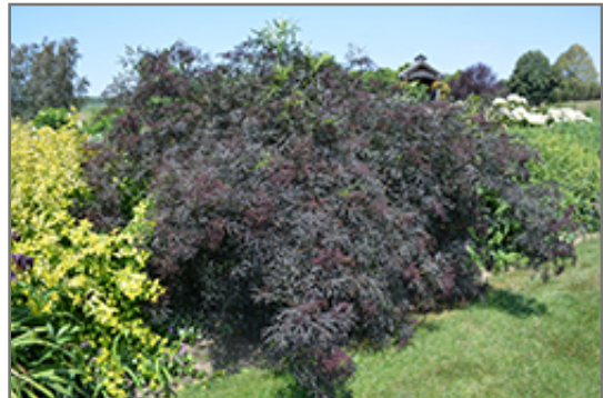
Black Lace Elder